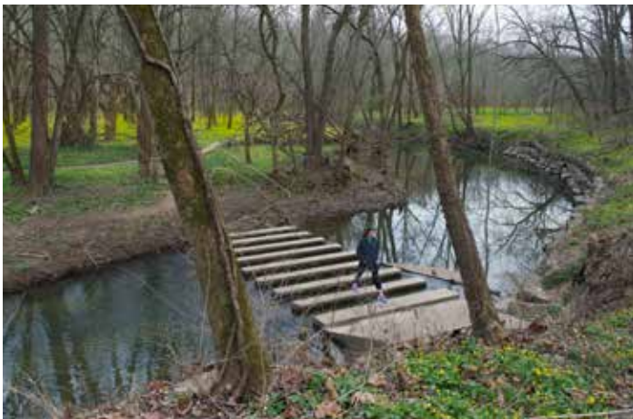
Middle Fork Beargrass Creek

For more information visit: LouisvilleMSD.org/WaterQuality