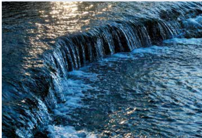
Middle Fork Beargrass Creek

MARCH 22 MSD Board Meeting 1 PM, Open Session YouTube.com/user/msdprojectwin/livestream