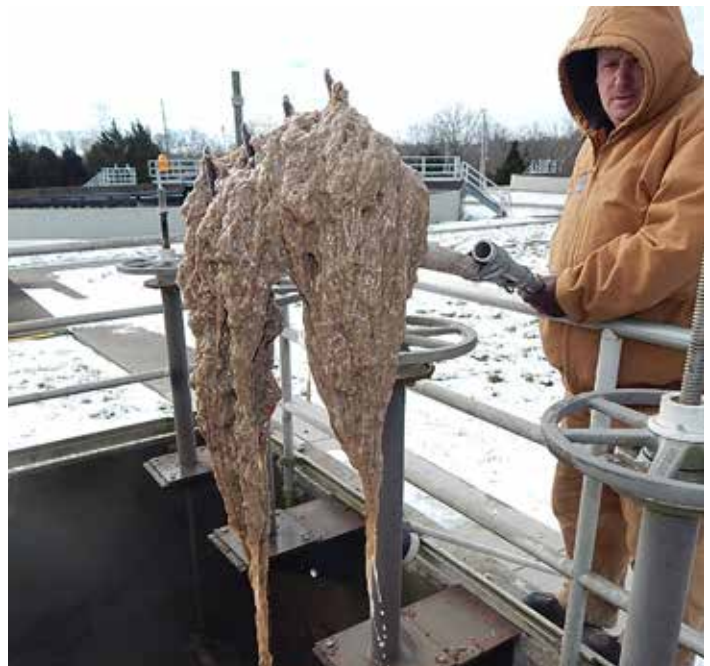
MSD workers must routinely remove clogs caused by "flushable" wipes from the collections and treatment systems.

While the tone of the "Bowl Patrol" might be light, it is intended to combat a severe problem. Rottet said he hopes people understand the consequences of flushing things that, frankly, shouldn't be flushed. "What you flush, does not just disappear," he said. "The only things that should go down a toilet are pee, poo and paper."