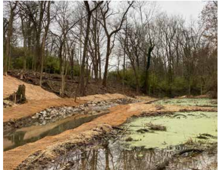
A stream and wetland restoration project near S. Peterson Avenue and Grinstead Drive will improve water quality of a tributary to Middle Fork Beargrass Creek.

Customers can apply for the credit at LouisvilleWater.com/MetroReliefPortal or call 502.583.6610 or 502.540.6000.