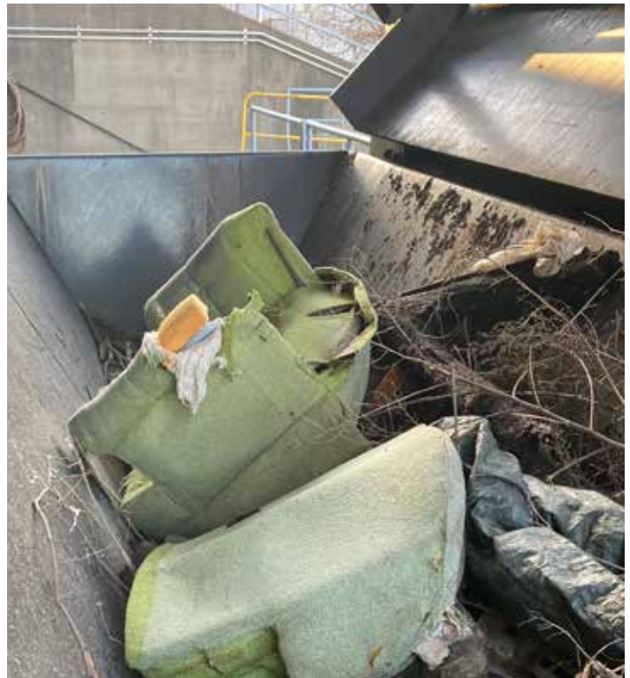
Flood Protection staff find a green recliner chair in the trash rakes at MSD's Beargrass Flood Pumping Station.

For information about organizing a stream cleanup in your area contact: Rhonda.Crotzer@louisvillemsd.org