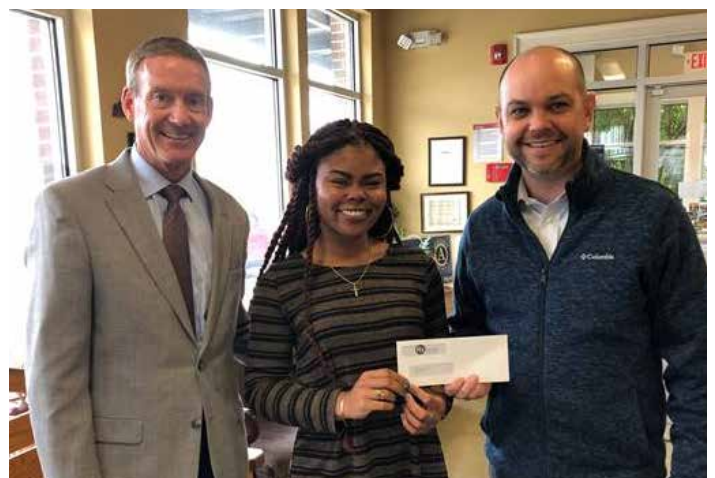
RA Consultants are leading the way with this new initiative, as they give to sponsor YouthBuild Louisville’s Building Lives Breakfast.

We invite our contractors to accomplish this goal by providing a Community Benefits Commitment of a financial contribution, volunteer hours, or in-kind services to local non-profits and schools in Jefferson County.