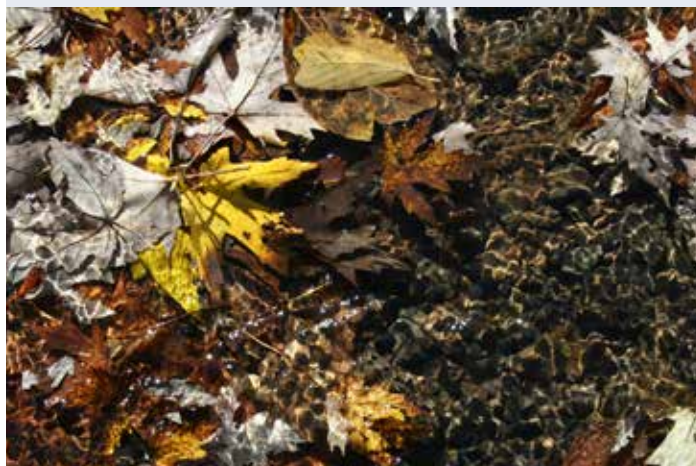
Leaves gather in the shallow areas of Floyds Fork.

DECEMBER 16 MSD Board Meeting 1 PM, Open Session, 700 West Liberty Street