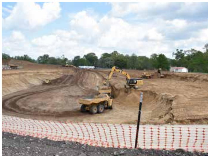
Digging for the Shawnee Park Basin began in early April of this year.

Achieving Safe, Clean Waterways for a Healthy and Vibrant Community