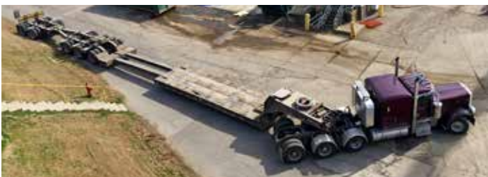
A 115-foot truck delivered the new high-yard switch house from South Dakota.