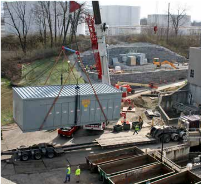
The new high-yard switch house is lifted from the transport truck bed.

In February, equipment to complete the new high-voltage yard at MSD's Morris Forman Water Quality Treatment Center (WQTC) began arriving. A new high-yard switch house was set into place by two cranes on February 24, 2017. The building was transported 1,200 miles from South Dakota and weighs 76,000 pounds. Work on the new high-yard should be complete by June 2017.