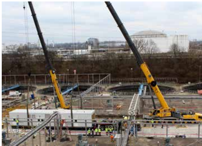
Cranes place a new oxygen generation component in place.

Morris Forman is Kentucky's oldest and largest wastewater treatment facility, beginning operation in 1958. It treats wastewater from 67 percent of Jefferson County and is a vital component in the health and safety of our community.