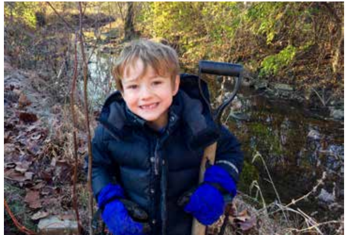
A young volunteer prepares to plant a sapling as part of the riparian stream buffer on Bartley Drive.