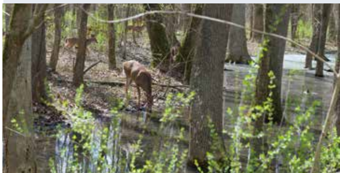
Beargrass Creek. — Photo courtesy of John Nation

1 PM, Open Session, 700 West Liberty Street