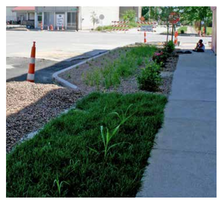
Phase 1 of the green infrastructure project in the Portland area was completed in June.