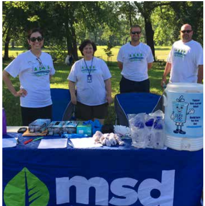
ABOVE: MSD employees made sure volunteers are equipped with gloves and plenty of trash bags.