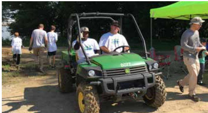
ABOVE: MSD employees provide motorized assistance to collect large items and bags of trash.