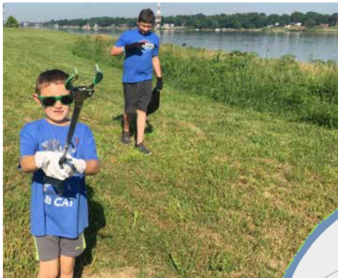
BELOW: Trash grabbers are always popular with the kids.

MSD thanks the volunteers who continue to help us realize Our Vision—Clean, Safe Waterways for a Healthy and Vibrant Community.