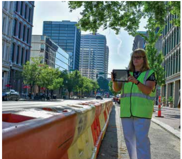
Inspectors regularly look for changes in the pavement that might indicate a cave-in.

BELOW: The parking lane along the south side of Main Street between Fourth and Seventh streets has been closed since March due to the threat of a cave-in of a large sewer line under the pavement.