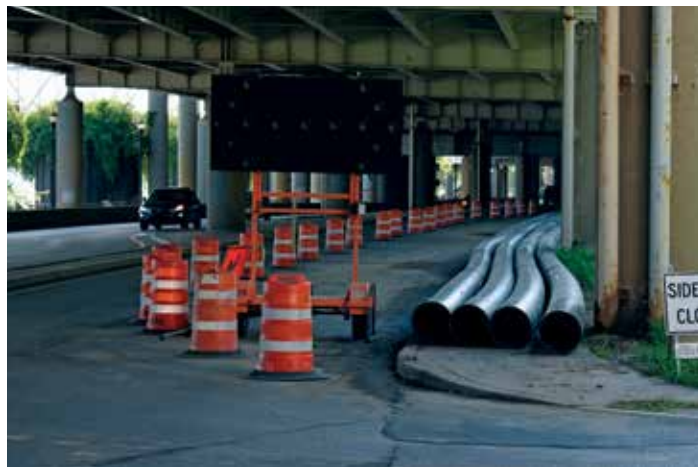
Pipes for the temporary pump-around are ready for installation along River Road.