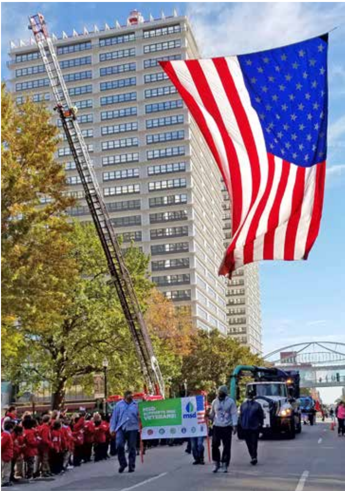
MSD Veterans are greeted by school children at the Veterans Day Parade on Main Street.