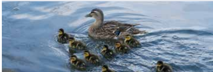
Ducklings swimming in Beargrass Creek.

JUNE 25 MSD Board Meeting 1 PM, Open Session, 700 West Liberty Street