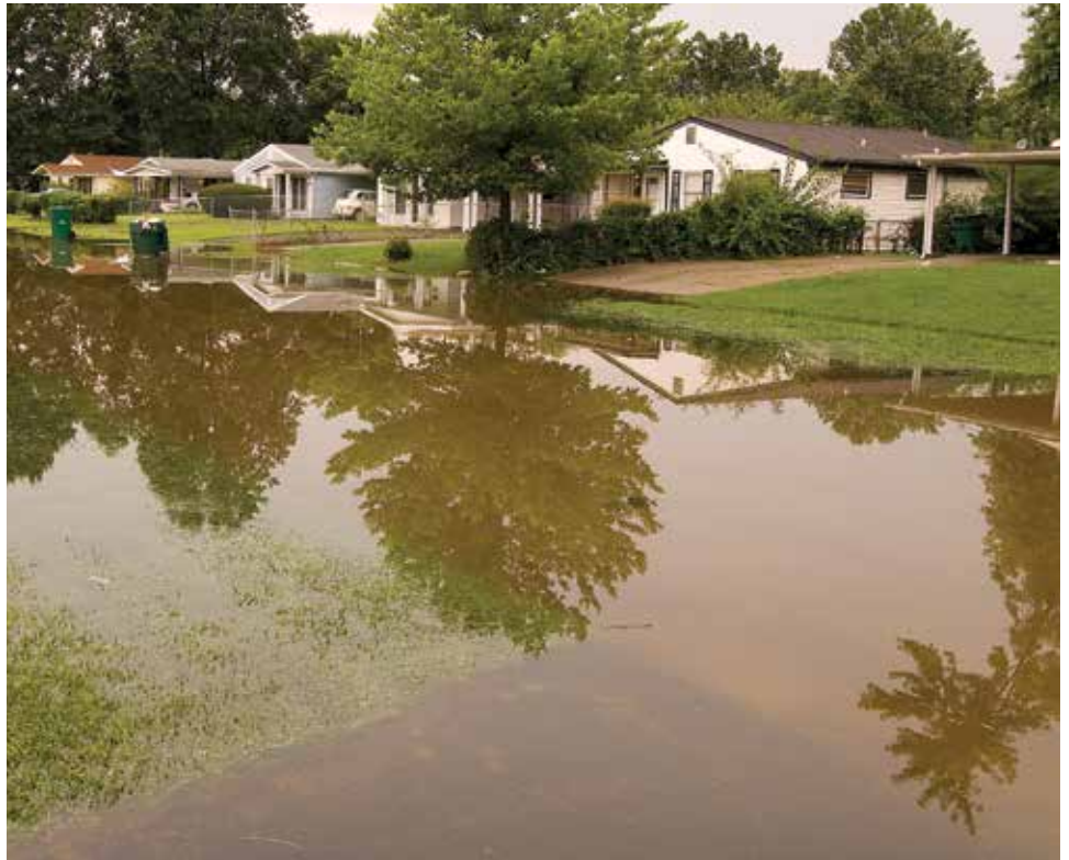
August 4, 2009, some areas experienced more than 7-inches of rain in less than an hour.

Lenders require flood insurance for those inside the mapped floodplain. Those who live outside of these areas can still be at risk for flooding. More than 20-percent of all National Flood Insurance Program flood insurance claims are from areas outside the mapped high-risk areas. Just a few inches of water from a flood can cause tens of thousands of dollars in damage. Protect yourself and your home by calling your insurance agent to learn more about flood insurance or by going to www.floodsmart.gov .