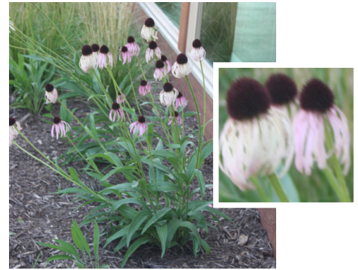
Dropseed Native Plant Nursery