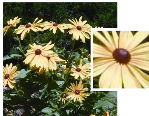
Missouri Botanical Garden