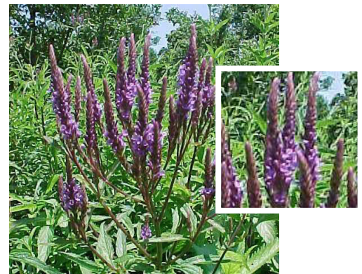
Missouri Botanical Garden