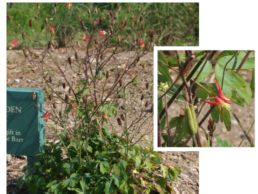
Dropseed Native Plant Nursery