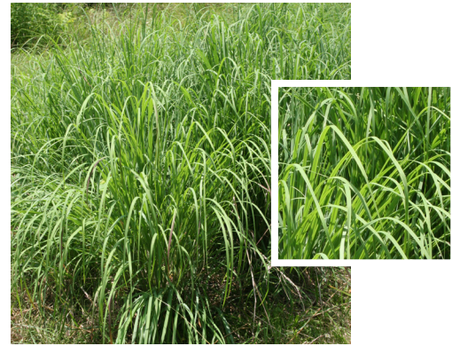
Dropseed Native Plant Nursery