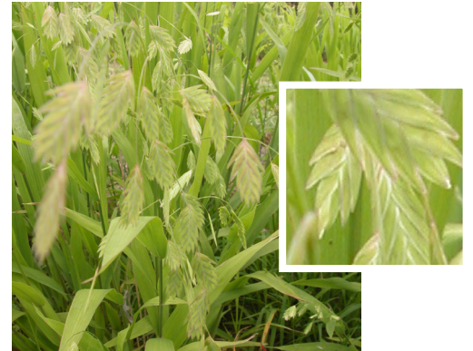
Dropseed Native Plant Nursery