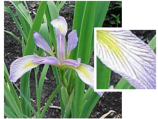
Missouri Botanical Garden