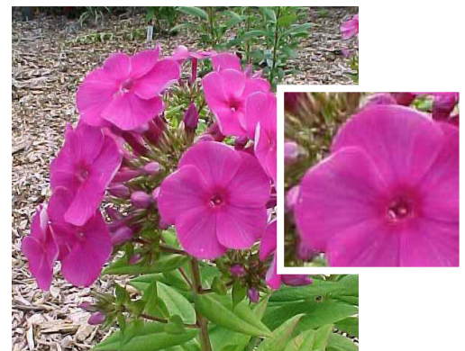
Missouri Botanical Garden