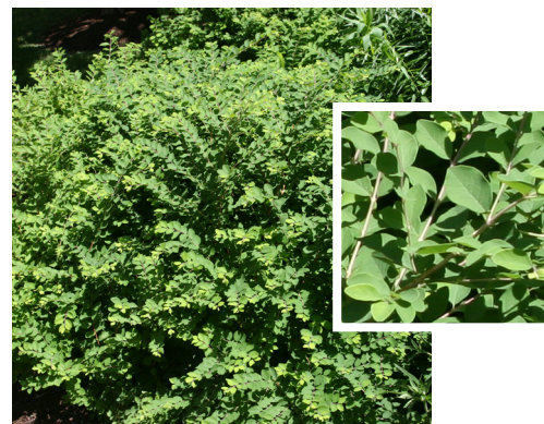
Dropseed Native Plant Nursery