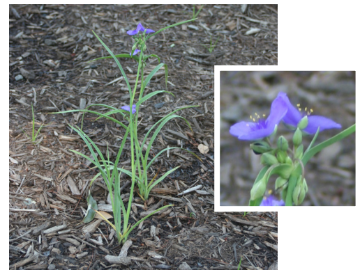
Dropseed Native Plant Nursery