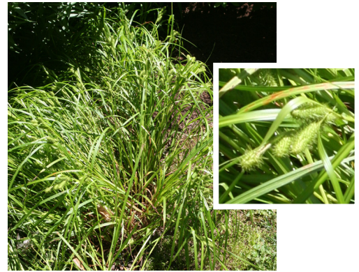
Dropseed Native Plant Nursery