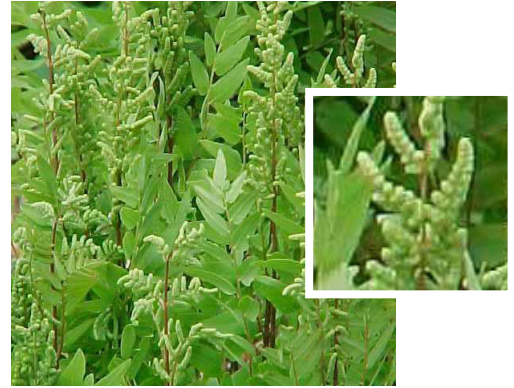
Missouri Botanical Garden