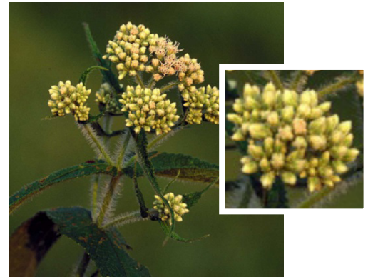
Dropseed Native Plant Nursery