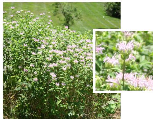
Dropseed Native Plant Nursery