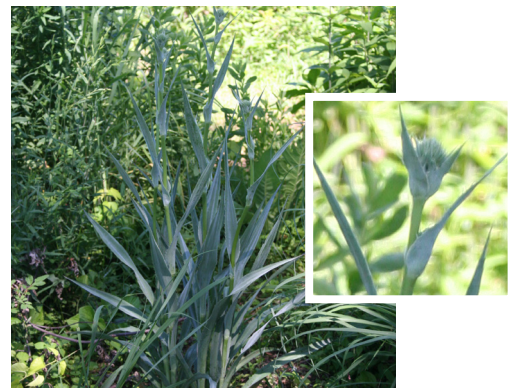
Dropseed Native Plant Nursery