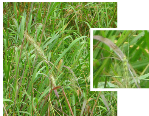
Dropseed Native Plant Nursery