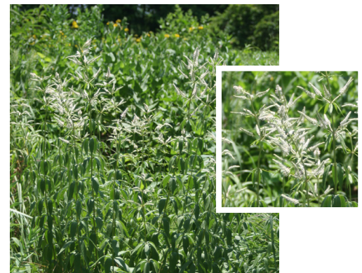
Dropseed Native Plant Nursery