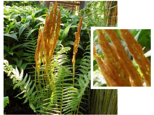
Missouri Botanical Garden