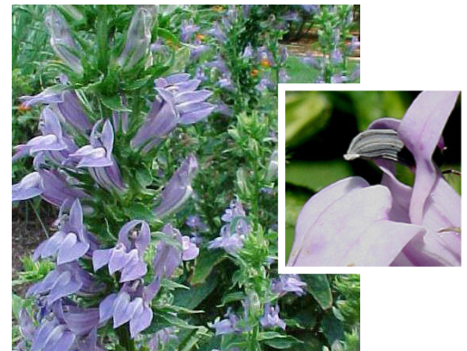
(left) Missouri Botanical Garden