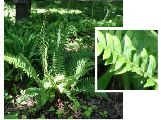
Dropseed Native Plant Nursery