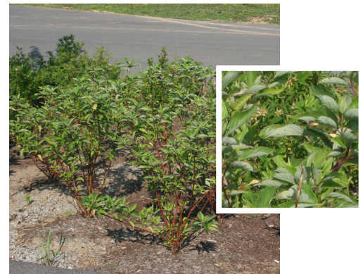
Dropseed Native Plant Nursery