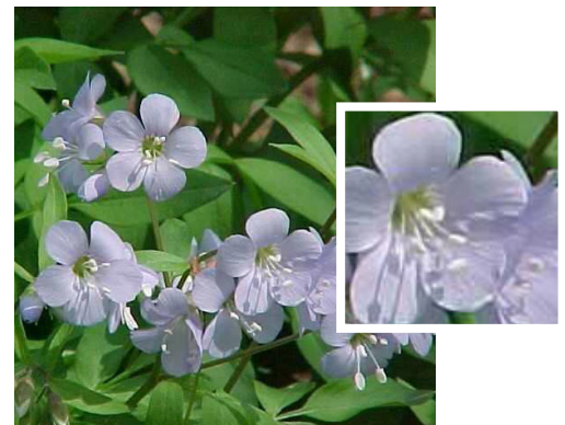
Missouri Botanical Garden