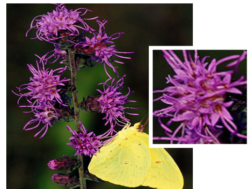
Dropseed Native Plant Nursery