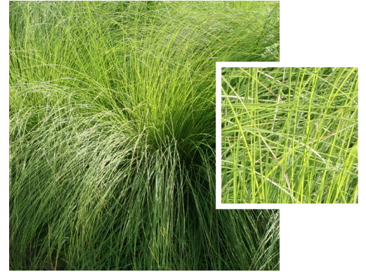
Dropseed Native Plant Nursery