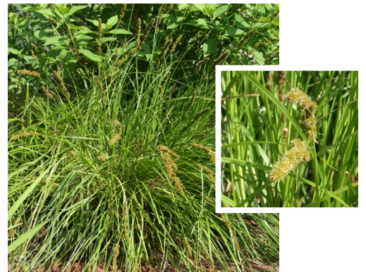
Dropseed Native Plant Nursery