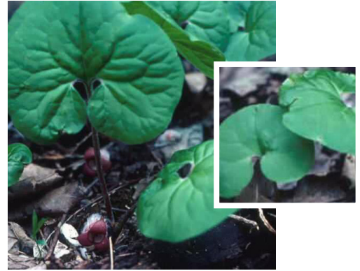
Missouri Botanical Garden