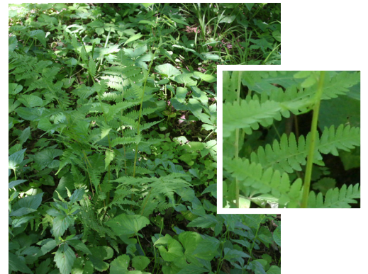
Dropseed Native Plant Nursery