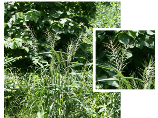
Dropseed Native Plant Nursery