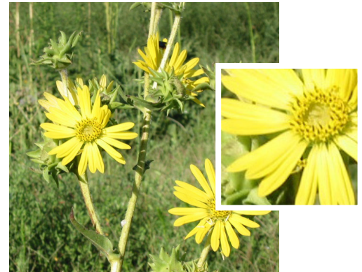
Dropseed Native Plant Nursery