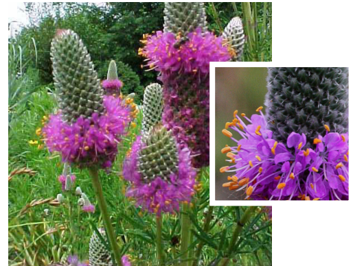
(left) Missouri Botanical Garden