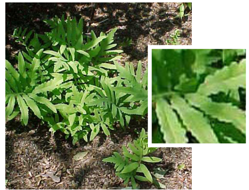
Missouri Botanical Garden