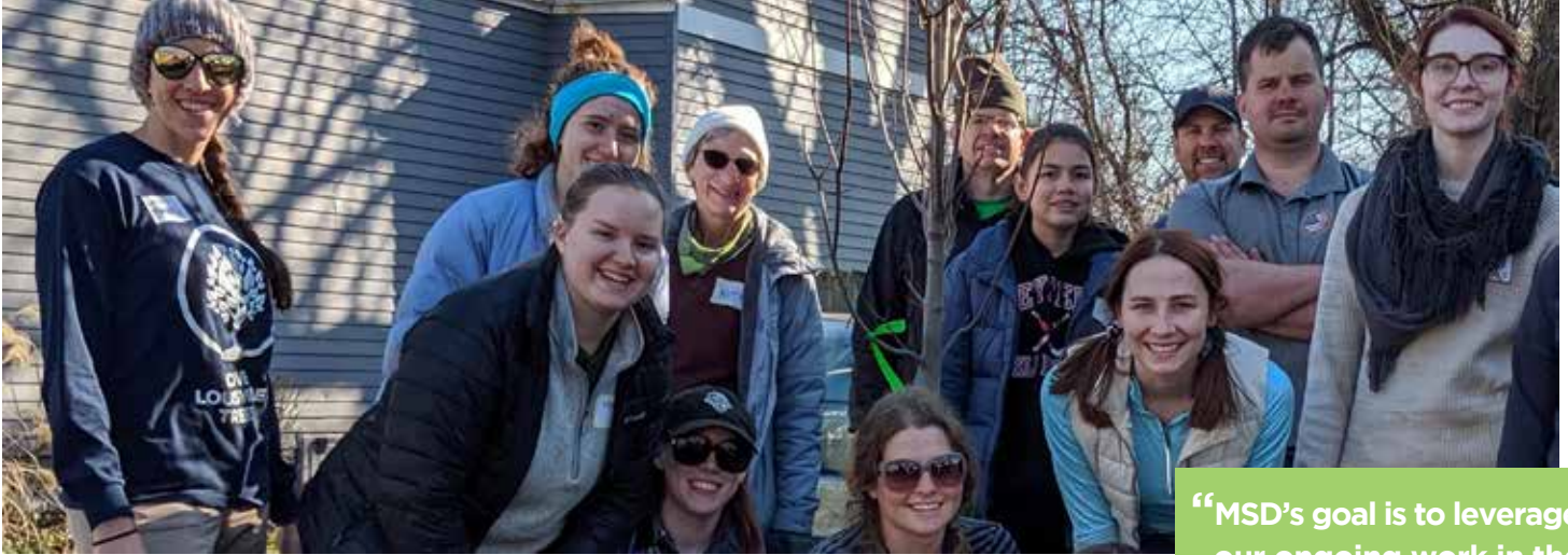
Employees of MSD contractor Stantec give their time planting trees in the Schnitzelburg and Meriwether neighborhoods in February.

MSD Community Benefits Program encourages firms working for MSD to invest in the community through a variety of ways, including workforce development, education and economic development. These programs can support job and contracting opportunities for residents, as well as our firms; expand pre-apprentice and apprenticeship programs; support eco-literacy programs for youth; provide small business