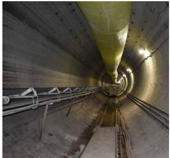
A small train inside the tunnel delivers crews to their worksite.

Interested in learning more? Visit our exhibit at the Kentucky Science Center ...or visit LouisvilleMSD.org/Tunnel