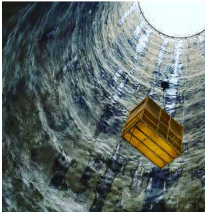
Workers board a metal basket and are lowered into the tunnel by a crane operator.

After the excavation is complete, the entire length of the tunnel is lined in concrete, making it watertight. The Waterway Protection Tunnel will store up to 55 million gallons of combined wastewater and stormwater during periods of heavy rain until capacity is available in the MSD sewer system. The contents are then pumped back into the system, conveyed to MSD's Morris Forman Water Quality Treatment Center for proper treatment, and later released into the Ohio River.