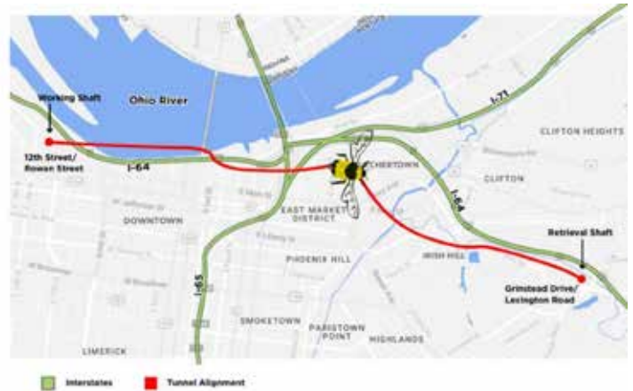
The path for the tunnel is shown in red. The boring machine—nicknamed Bumblebee—is moving from west to east.