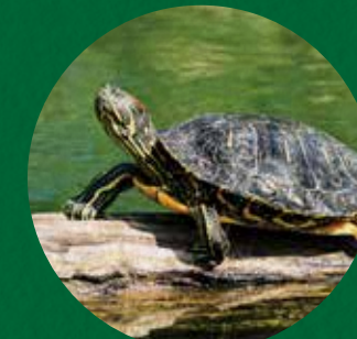
Pond Slider Turtle