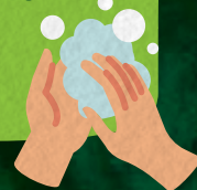
Be safe and wash your hands after encountering water near a CSO.

Combined sewer overflows (CSOs) can occur when it rains, and sewer pipes that carry both stormwater and wastewater fill up and overflow into streams and the river. Several outlets for these overflows are visible along Beargrass Creek. MSD's underground storage basins and tunnel significantly reduce these overflows.